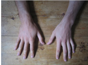
Static – no movement

How would the hands be best positioned to recreate your drawing?